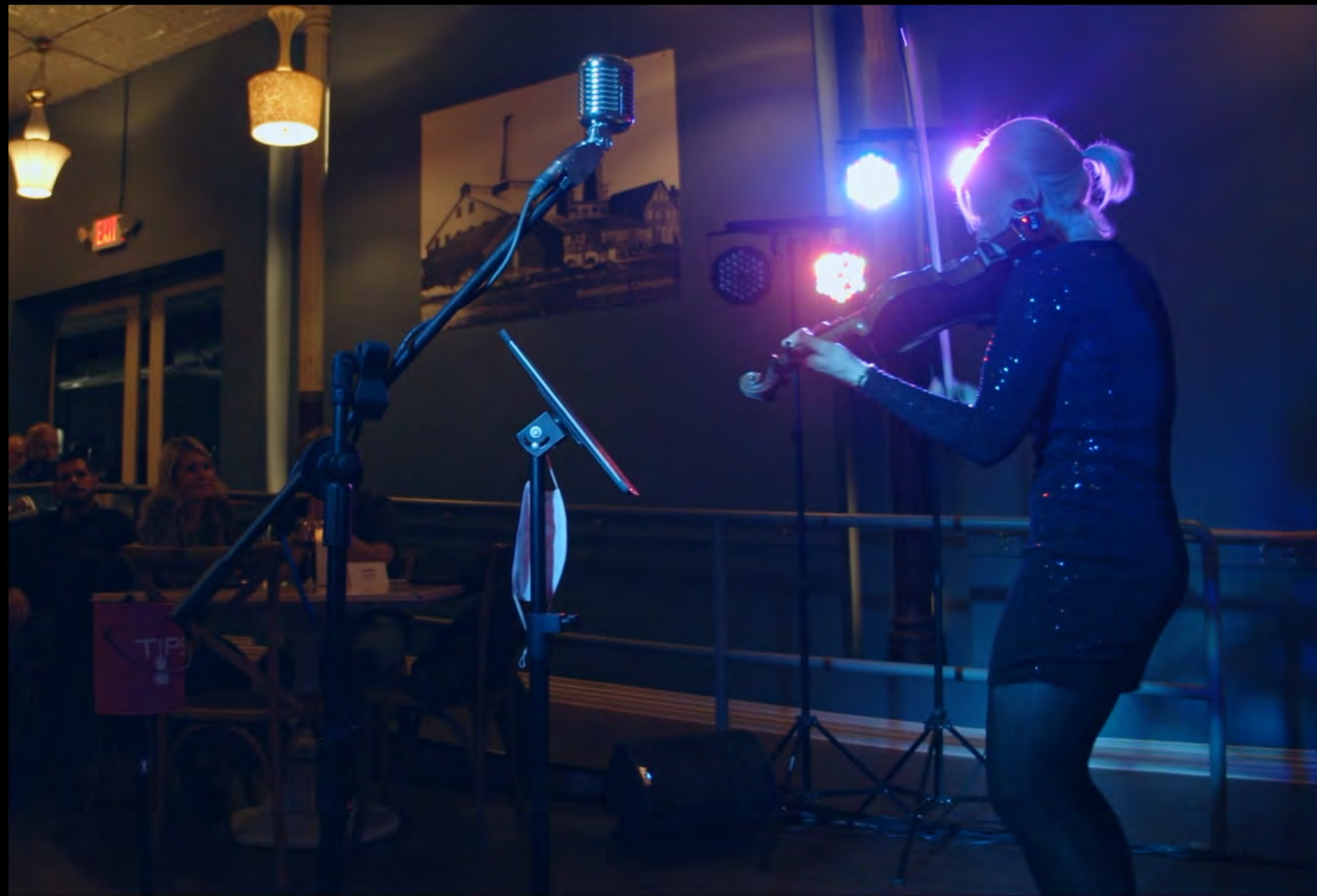
Highlights / Free Bird