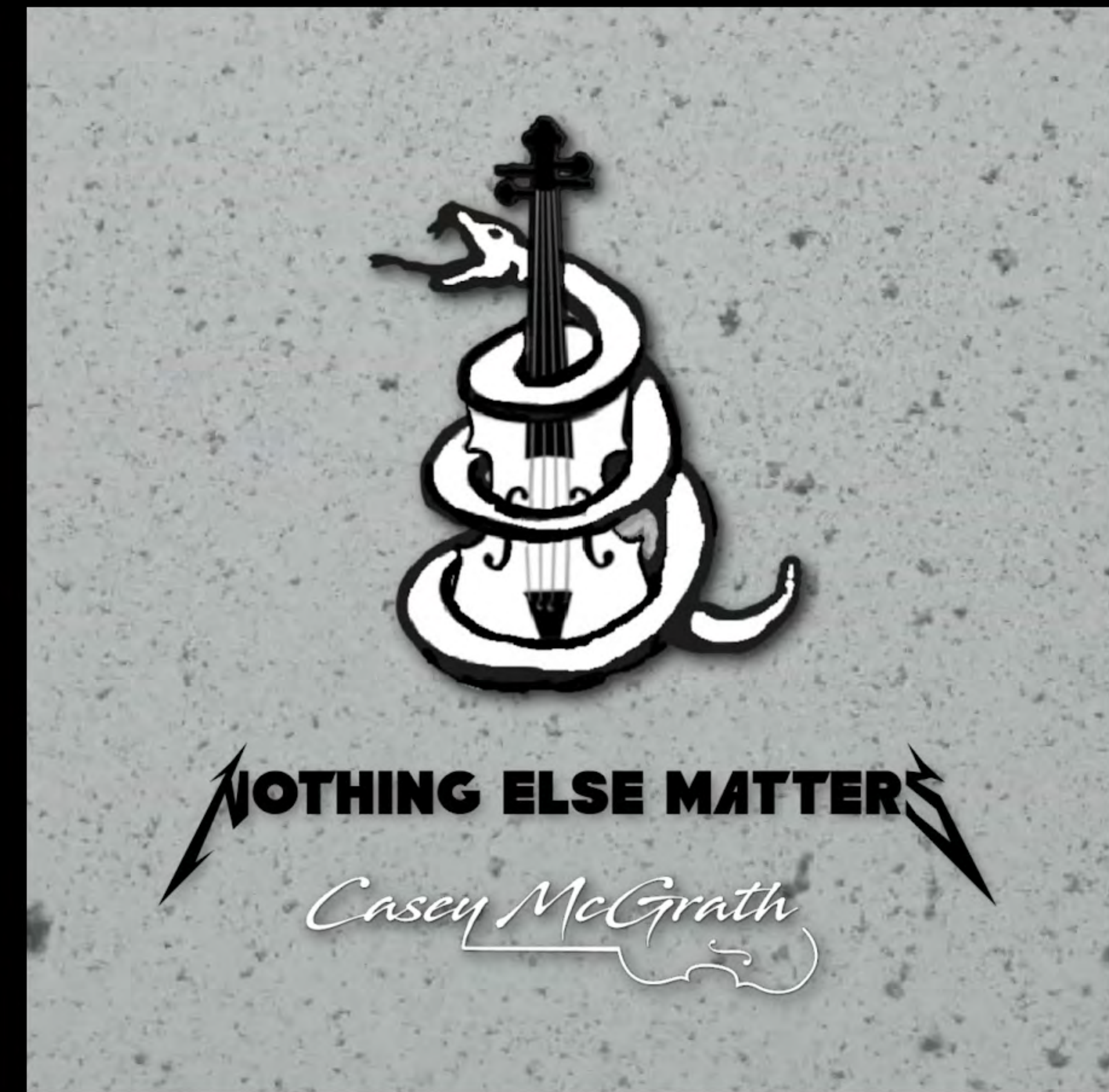
Nothing Else Matters